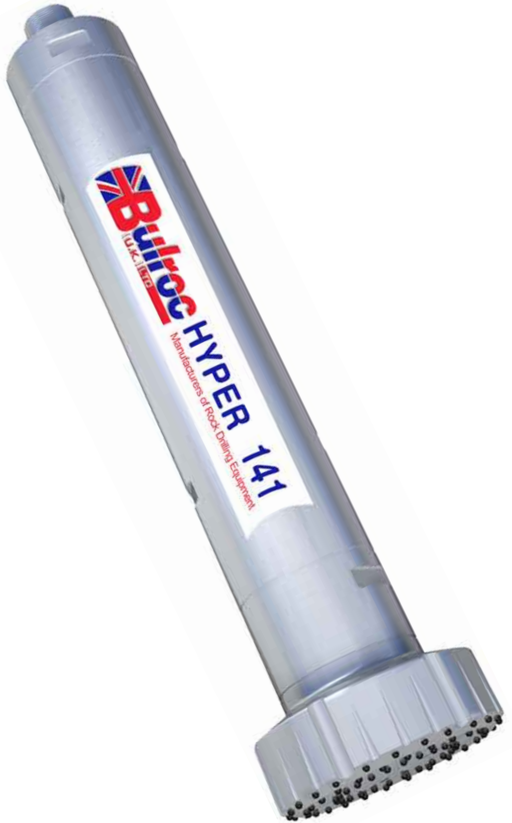
Bulroc Hyper 141 D.T.H Hammer