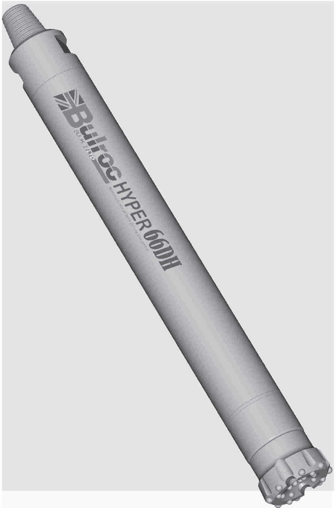
Hyper 66 / QL60 Deep Hole Hammer